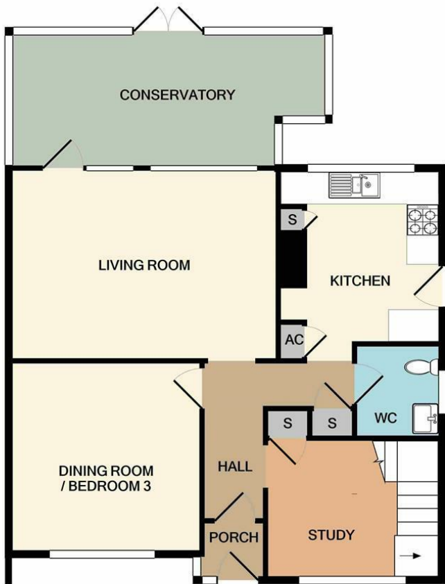
GROUND FLOOR APPROX. FLOOR AREA 821 SQ.FT. (76.2 SQ.M.)